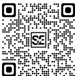
Scan QR Code For More Information