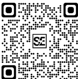
Scan QR Code For More Information